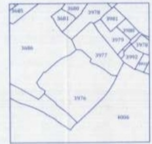
MOUZA PLAN. N.T.S.

AREA STATEMENT :- LAND AREA - 37 R/L - 6 CH - 10 SQ.FT. = 2500.936 SQ.M PERMISSIBLE AREA AFTER RELEASING ROAD = 2427.323 SQ.M. PERMISSIBLE GROUND COVERAGE = 1213.6616 SQ. M. @ (50%) PROPOSED GROUND COVERAGE = 1196.471 SQ.M. (49.292 %)